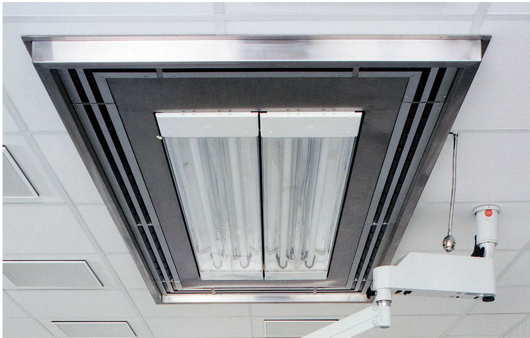
Fresh Air Hood build into the ceiling

Technical data and dimensions, see back page