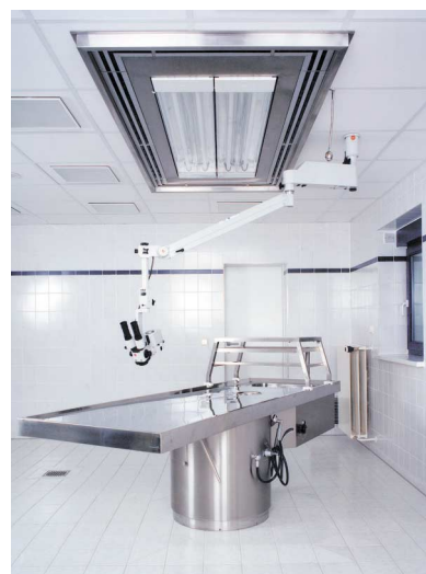
Autopsy Table with Fresh Air Hood

Subject to technical modifications as required by product improvements.