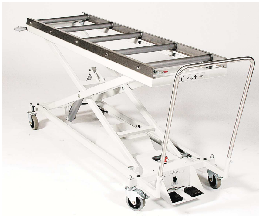
Lift and transport truck HTW 50/130

Technical data and dimensions, see back page