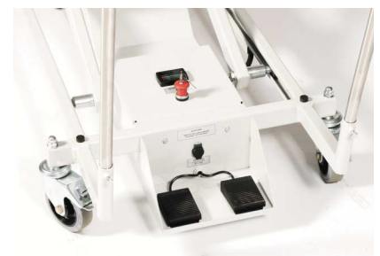
Foot switch HTW 50/130